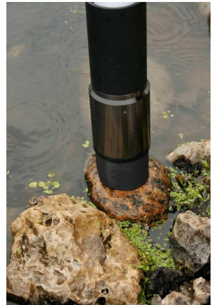
BenthoTorch: For measurement of benthic algae on different substrates