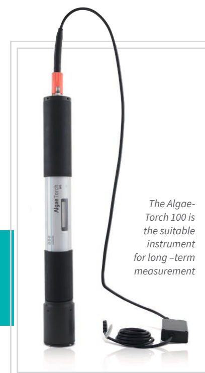
The AlgaeTorch 100 is the suitable instrument for long-term measurement